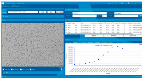
HORUS Software for recording and analysing the cell culture from a computer

The image analysis and results from the Cytonote are performed from the HORUS dedicated software. HORUS is application oriented, it provides automatic cell count, quantitative confluence determination, cell size or cell tracking. Full field images (30 mm 2 ) of the samples are stored and can be accessed and zoomed at any time. It is designed to monitor up to 6 Cytonote simultaneously for 6 parallel or independent cell cultures.